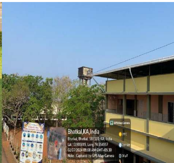
Green Initiatives outside the Campus