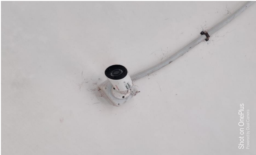
Shot on OnePlus Powered by Dual Camera