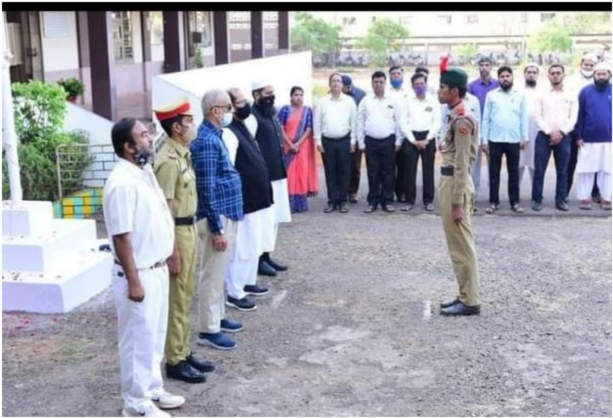
Independence Day 2021-22